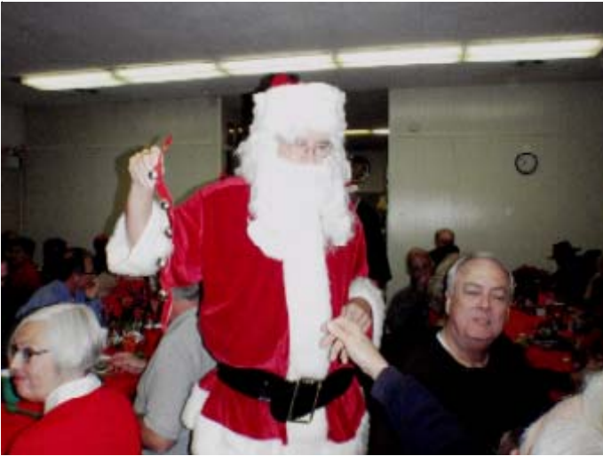
Santa Arrives at the Party

The Annual Squadron Christmas Party was held on 10 December 2009. The event featured an excellent buffet dinner and “Chinese Gift” exchange. Santa made an appearance and a good time was had by all. Here are some photos of the event.