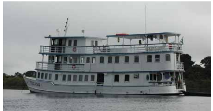
River Boat Tucano anchored in the Rio Negro River, Amazonas, Brazil.