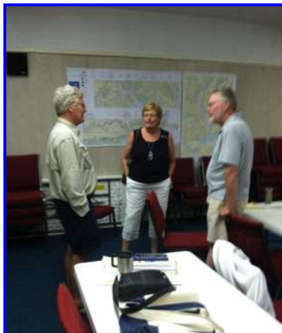
Chart Reading Seminar 21 July 2012 Navigating our Coastal Waters