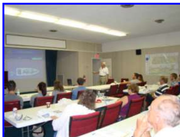
ABC Class August 2012