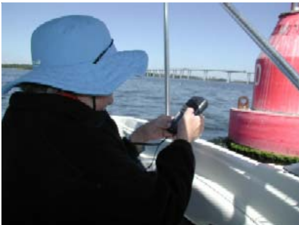
Getting a GPS Fix on a Buoy in Cooperative Charting

Just a reminder, we have recycle bins at the club house for your plastic and glass containers and metal drink cans. Please make sure you throw all these type of things in the recycling bins and not the trash as the Squadron continues to be good stewards of the environment.