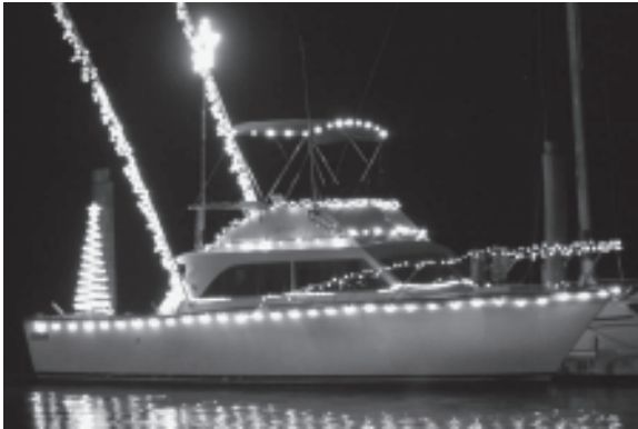
“Almost Ready” at Night